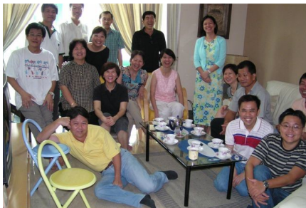
Some of the organizing committee having a well deserved break.

Surely, the Family Day was a great way to testify that GOD IS GOOD to us as a family in Christ, and to keep our spirits high. Three cheers to the organizing committee.