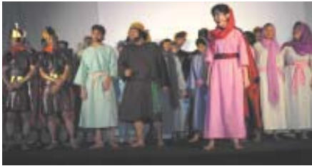
A section of the huge drama cast

Intercessors – Thanks for praying and interceding. The Lord has heard your prayers.