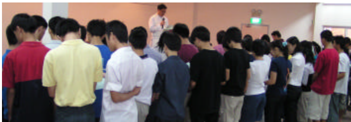
Our Youths and their Youth Leaders (below), who played significant roles in the successful production of the Easter Musical Drama – an evangelical outreach event.

(Acts 3:13) Jesus himself said to his disciples, “If anyone wants to be first, he must be the very last, and the servant of all.” (Mk 9:35)